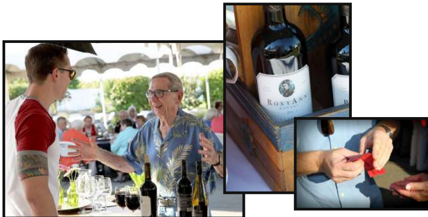
from last year's Party

Reservations are due by Monday, August 20. Call the Club at 541-772- 4707 or click Summer Party to reserve now!